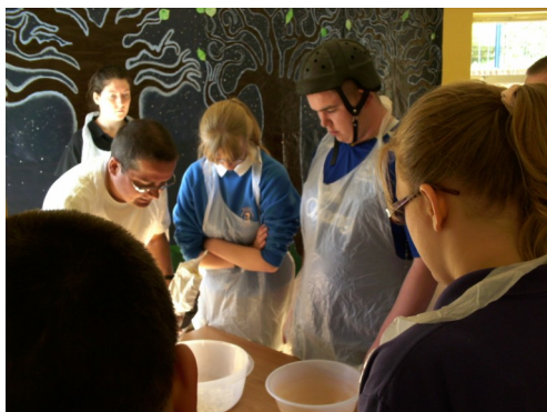
Cooking class in a European Lifestyles school