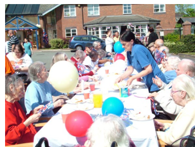
(photographs from Arundel Park & Greenheys Lodge , Liverpool).