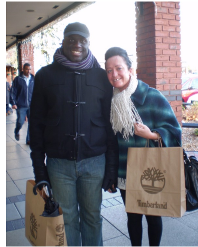
European Lifestyles Tenants at the shops, Cheshire

European Lifestyles’ children and education services have also been recognised as centres of excellence for transitional planning, for the second year running, in the government issued “Diverse Britain” publication.